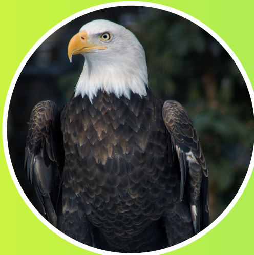
Bald Eagle - B