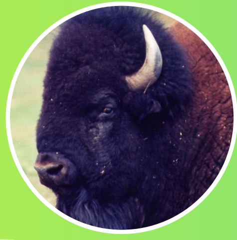
Bison - I