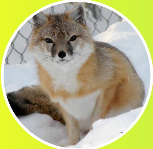
Swift Fox - D