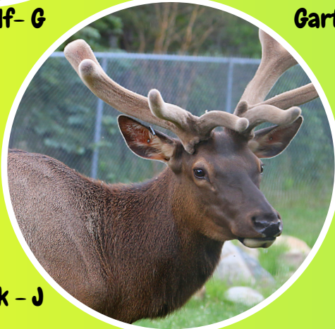
North American Elk - J