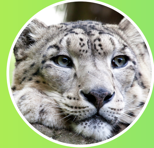
Snow Leopard - F