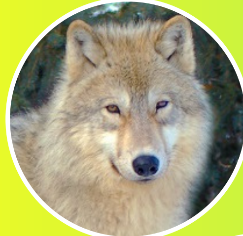
Grey Wolf - G