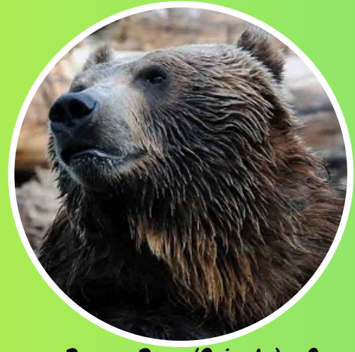
Brown Bear (Grizzly) - C