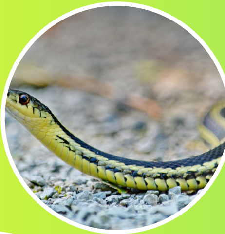
Garter Snake - H