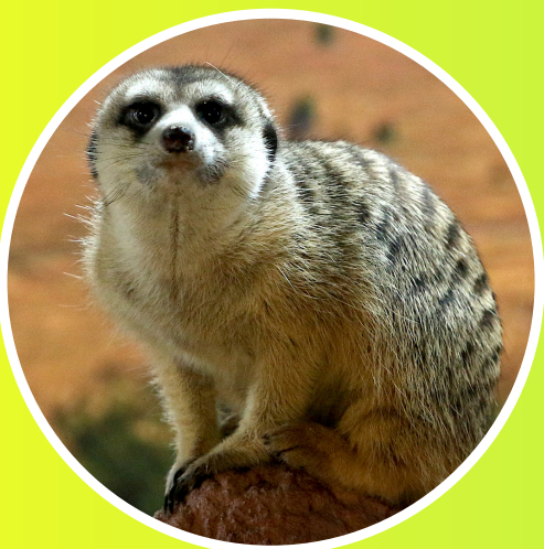
Meerkat - A