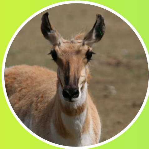
Pronghorn - E