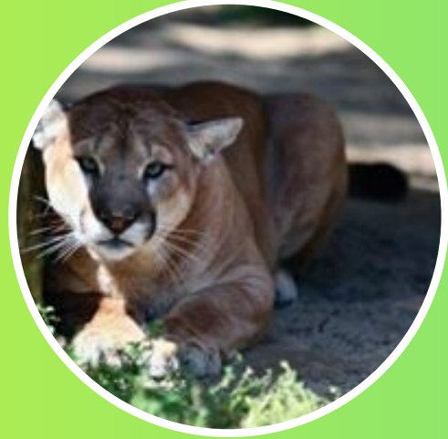
Cougar - F